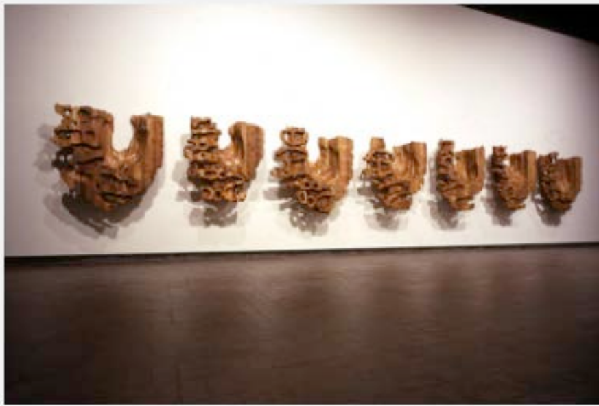
Ursula von Rydingsvard, Lace Collars, 2002.