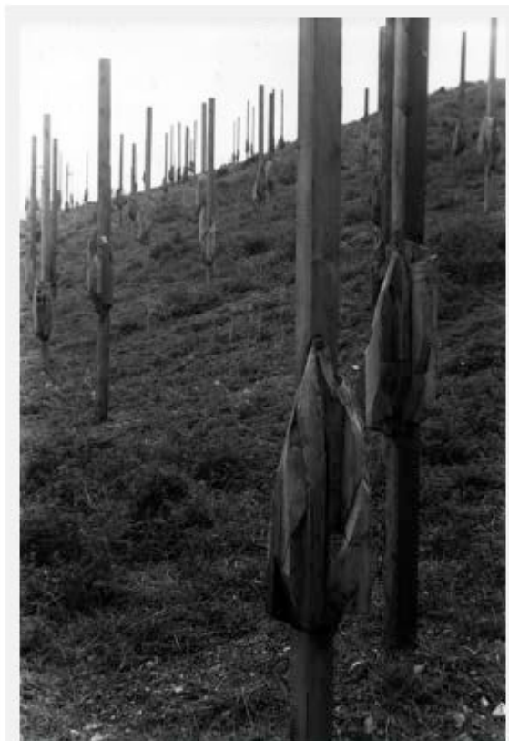
Ursula von Rydingsvard, Song of a Saint (St Eulalia) (detail), 1979.