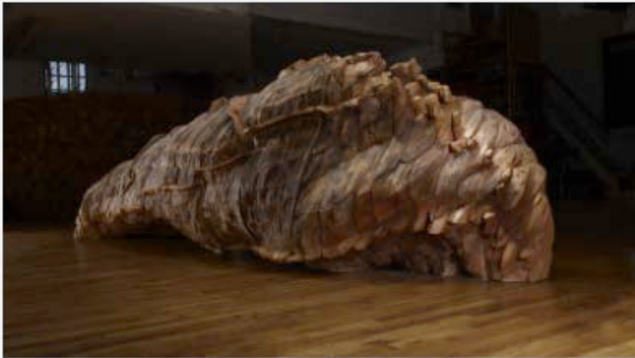
Ursula von Rydingsvard, Ocean Voices, 2012.