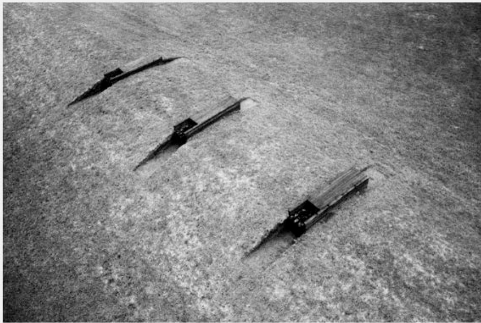
Ursula von Rydingsvard, Tunnels on the Levee, 1983.