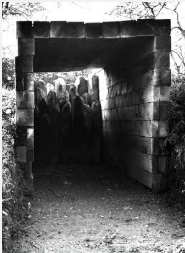
Ursula von Rydingsvard, Tunnels on the Levee, 1983.