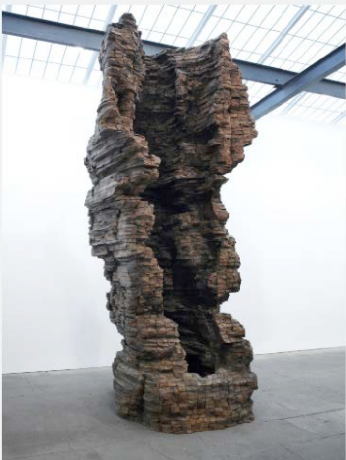
Ursula von Rydingsvard, Wall Pocket, 2003-04.