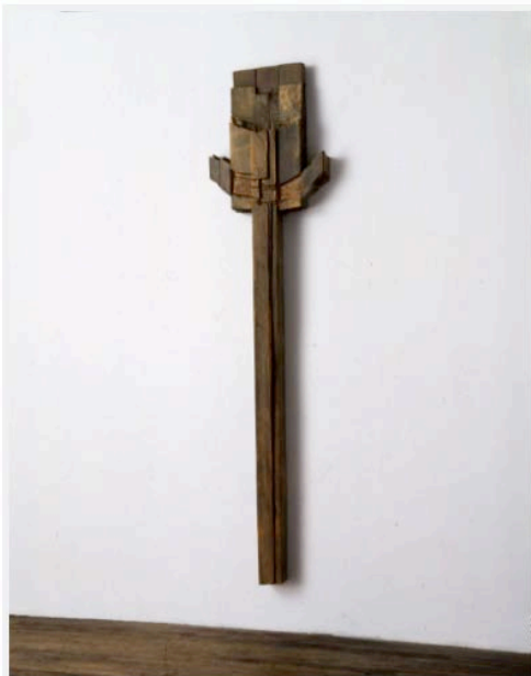
Ursula von Rydingsvard, Schwitters' Shovel, 1989.