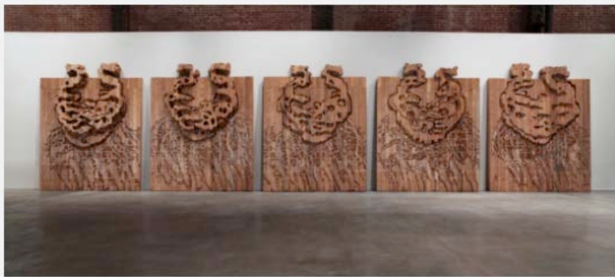
Ursula von Rydingsvard Five Lace Medallions, 2006.