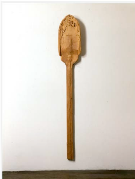
Ursula von Rydingsvard, Paul's Shovel, 1997.