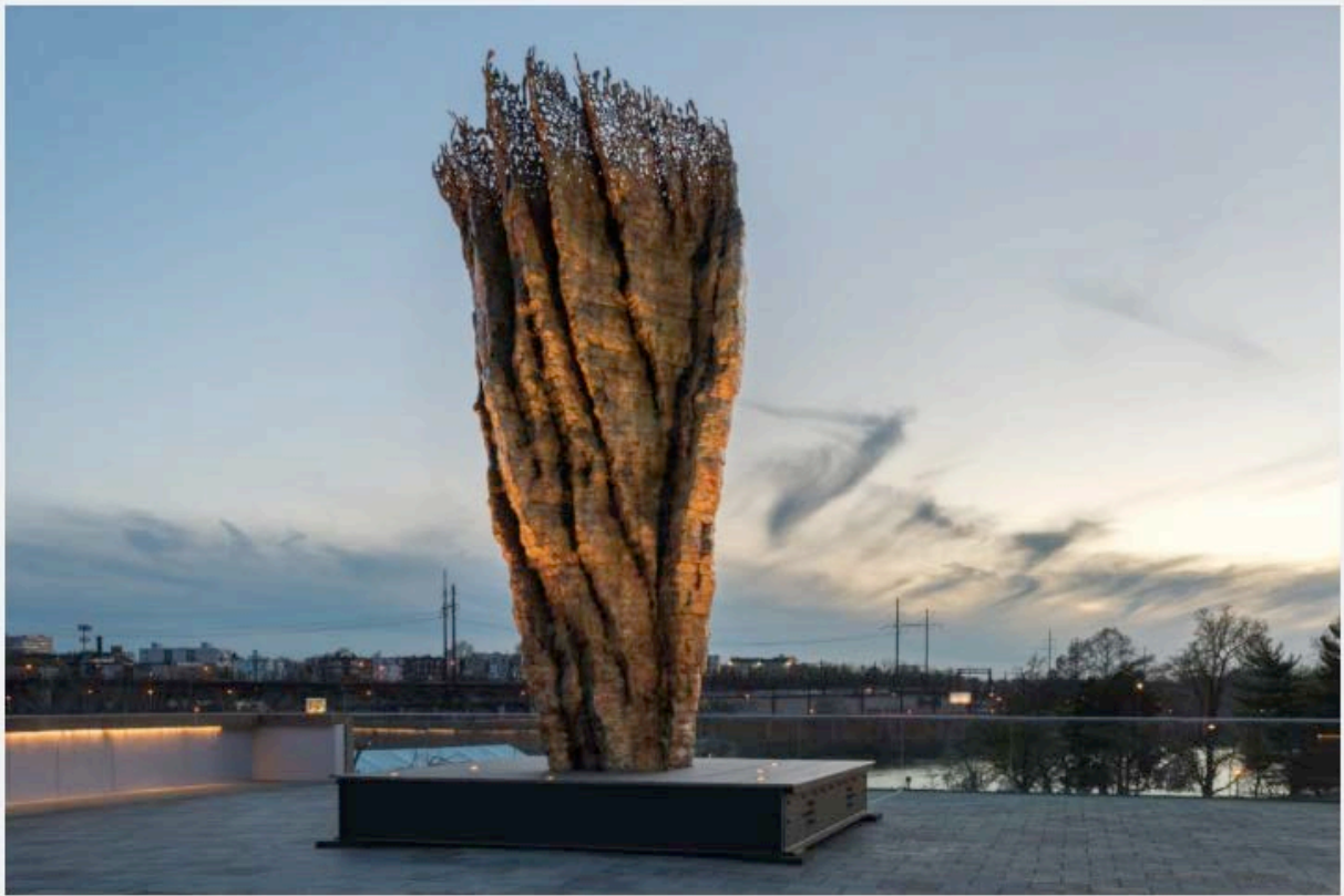
Ursula von Rydingsvard, Bronze Bowl with Lace, 2013-14 as installed at the Philadelphia Museum of Art.