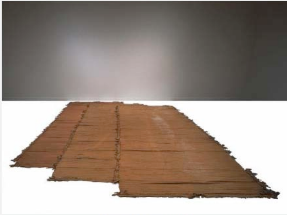
Richard Serra, Untitled, 1968.