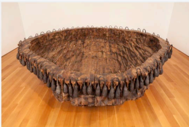
Ursula von Rydingsvard, Ocean Floor, 1996.