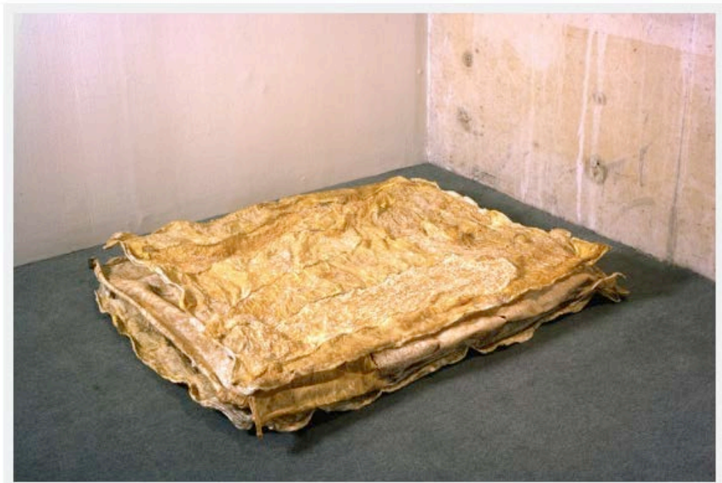
Ursula von Rydingsvard, Untitled (Stacked Blankets), 1995.