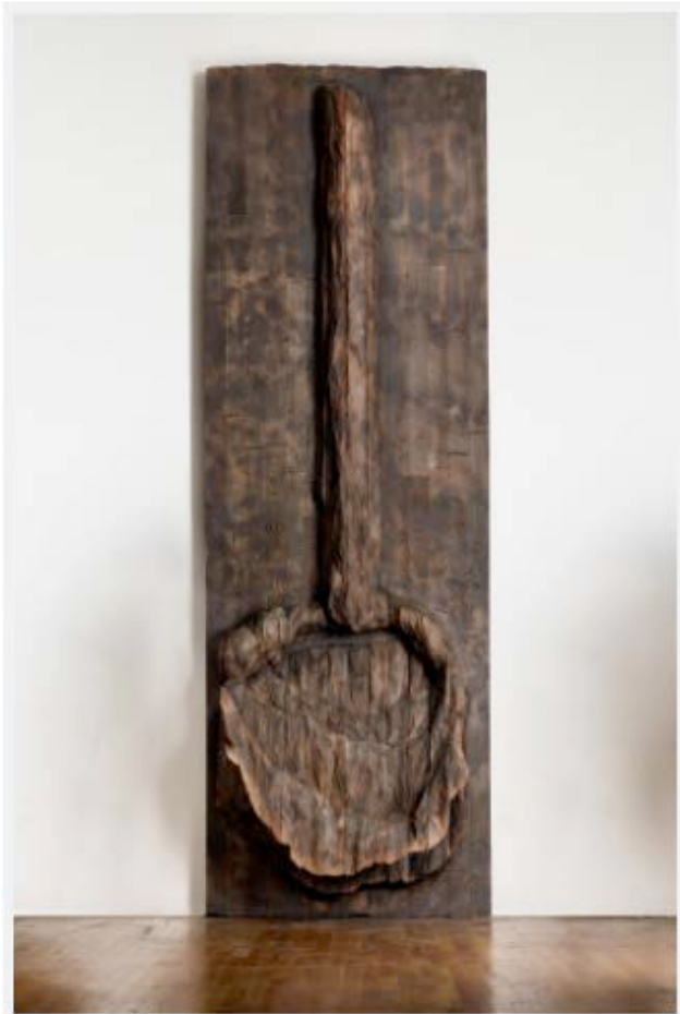
Ursula von Rydingsvard, Sunken Shadow, 2011.