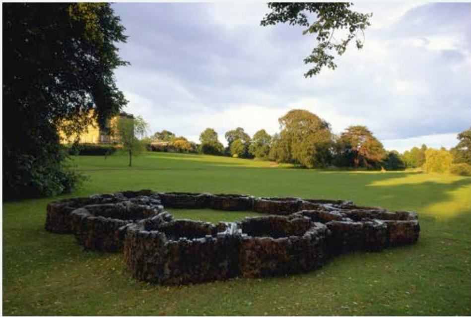
Ursula von Rydingsvard, Hand-e-over, 1996.