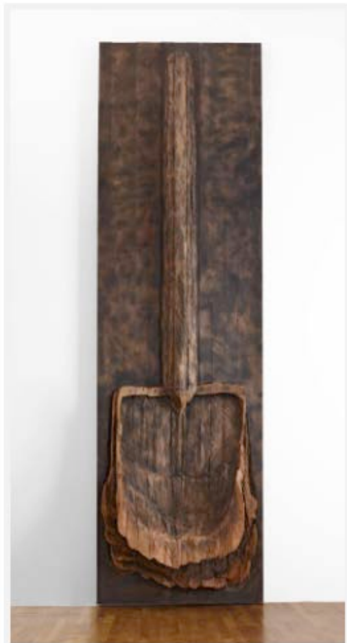
Ursula von Rydingsvard, Echo, 2011.