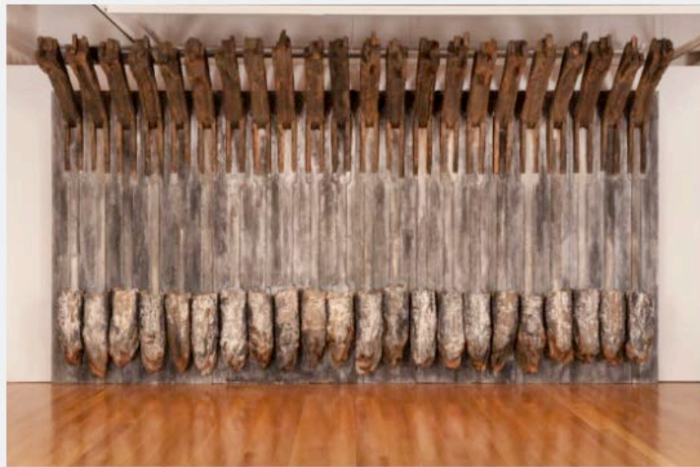
Ursula von Rydingsvard, Zakopane, 1987.