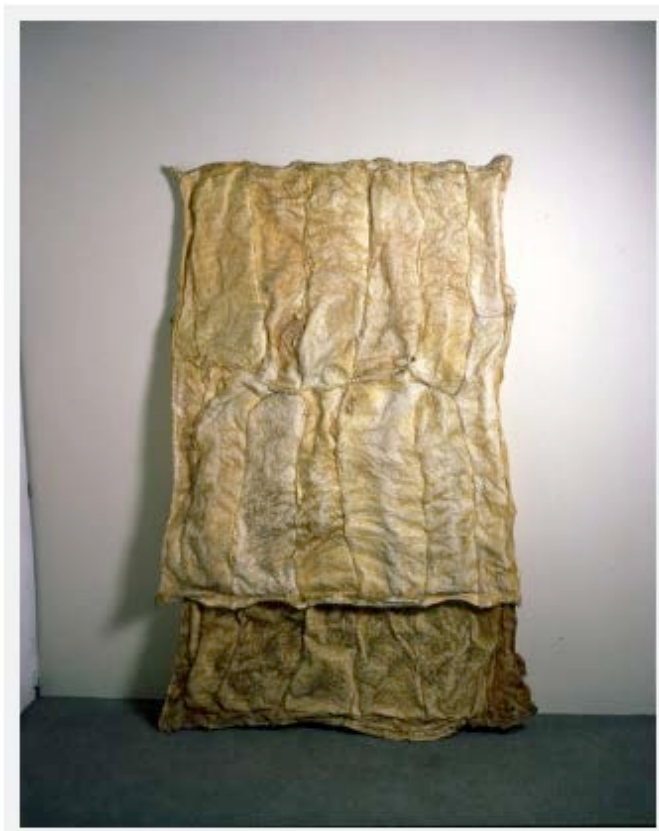
Ursula von Rydingsvard, Untitled (Pinned Blankets), 1995.