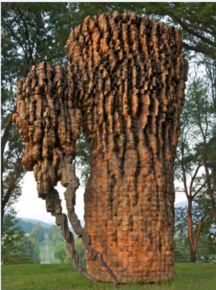
Ursula von Rydingsvard, Luba, 2010.