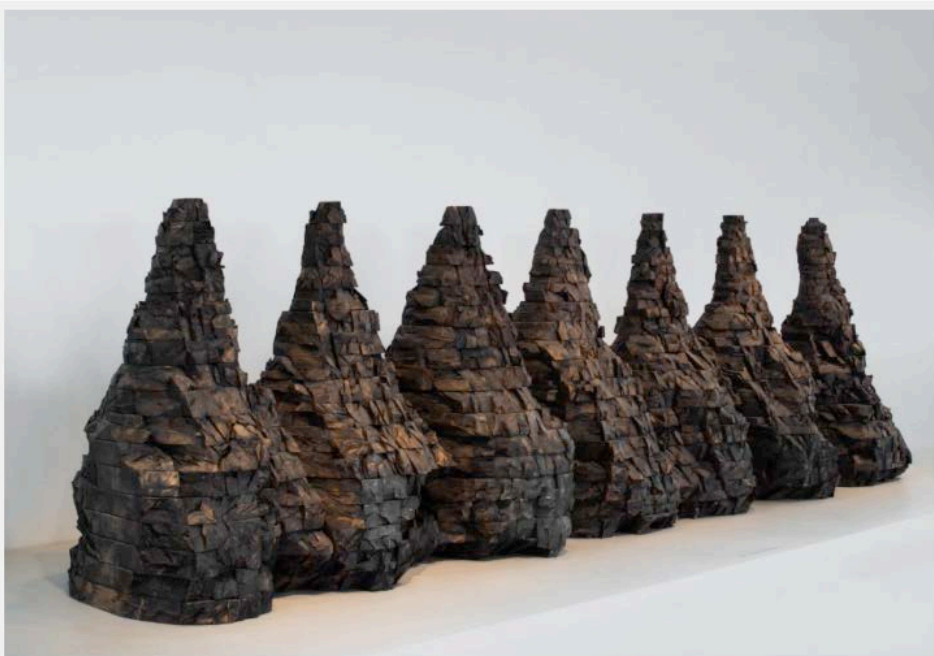
Ursula von Rydingsvard, Untitled (Seven Mountains), 1986-88.