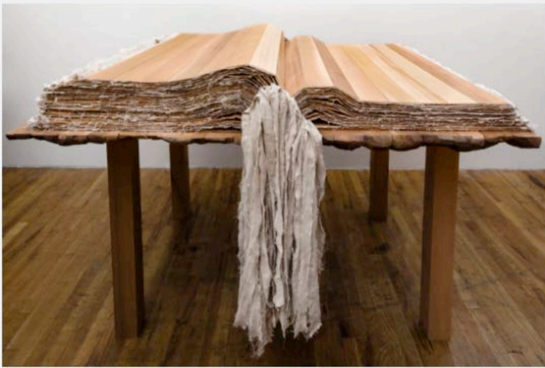
Ursula von Rydingsvard, Book with No Words II, 2017-18.