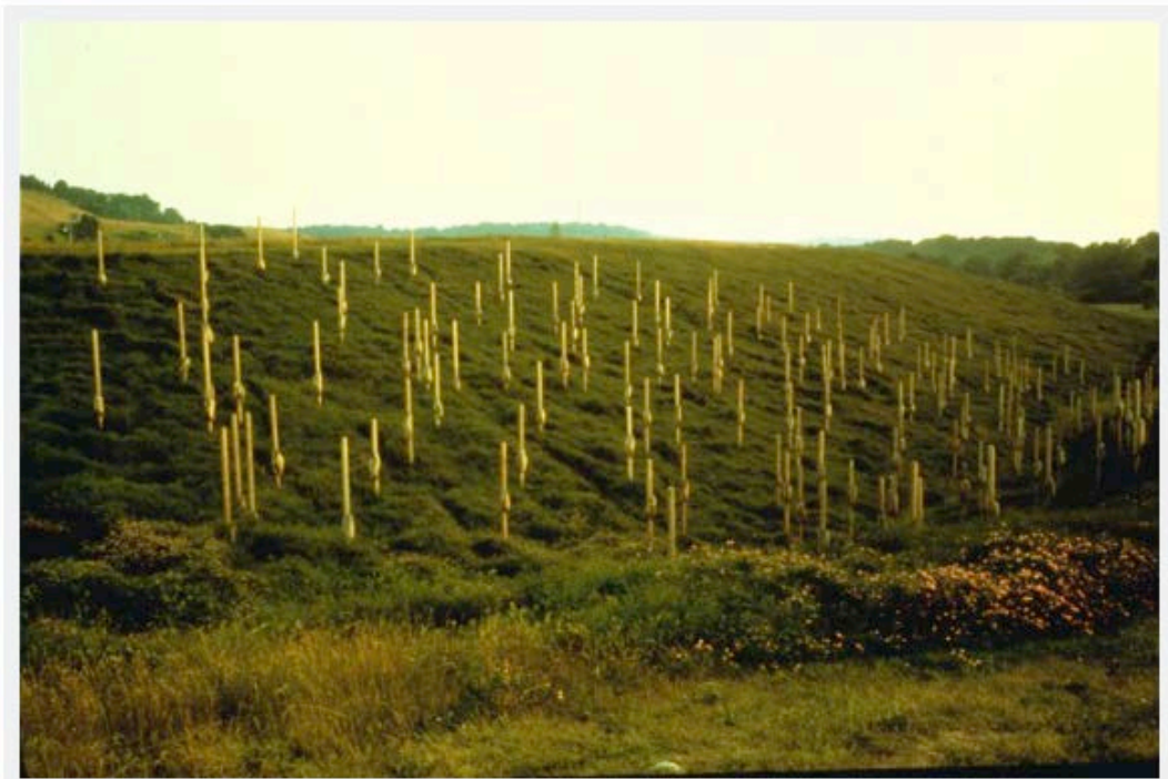
Ursula von Rydingsvard, Song of a Saint (St Eulalia), 1979.